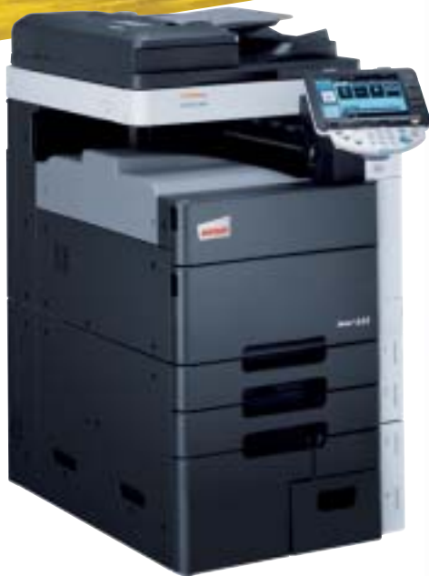
ineo+ 652 with output tray (OT-503)