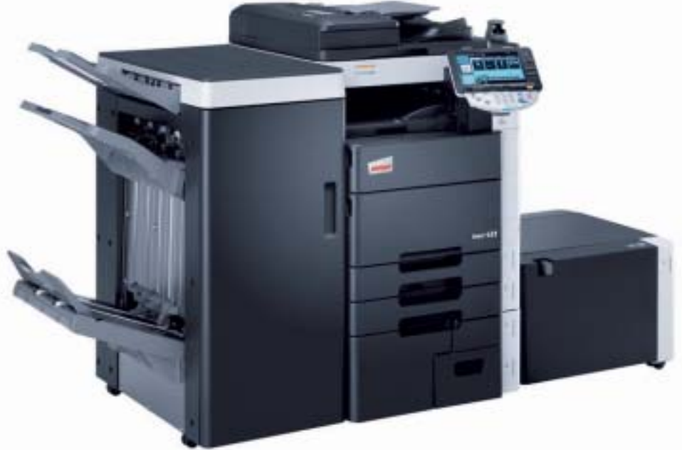
ineo+ 652 with staple finisher (FS-526), saddle kit (SD-508), working table (WT-506), biometric authentication (AU-102) and large capacity tray (LU-204)